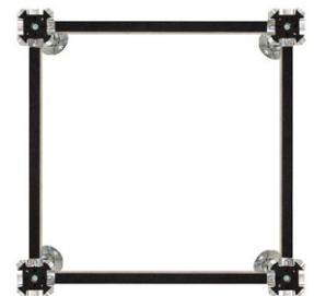
STQ GRID STRUCTURE

Formed by a plate of 80x80mm hot pre-galvanized steel sheet, specially blanked in order to obtain the necessary rigidity and allow an excellent grip of the possible gluing. By means of wire welding a square tube of 18.5x18.5 mm galvanized steel is applied. 1.2 mm (20x20mm sp, 2mm for H.> 298mm) with special calibrated bosses that act as a guiding system for the grafting of the head. A nut with unscrewed notches completes the base.