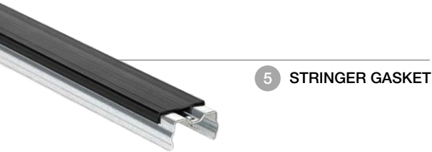
5 STRINGER GASKET

It is composed of pedestals which allow a height adjustment from 35 mm to 1030 mm and connecting stringers. The pedestals are arranged in a 600 x 600 mm grid, and include: