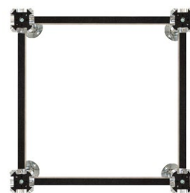
STO GRID STRUCTURE

The element that rests on the slab, composed of a metal plate 90 mm in diameter and 1.8 mm thick, sheared to obtain the necessary rigidity and to guarantee excellent grip to any glue. A 2 mm M16 tie rod 30 to 200 mm long is applied by arc weld. The weld is performed to ensure the two elements are perfectly joined. A nut with anti-backoff notches allows the pedestal to be adjusted.